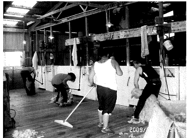
Figure 1, shearers and sorters.

ing Sheds, describe the noise exposure associated with shearing activities and help to define the acoustic environment.