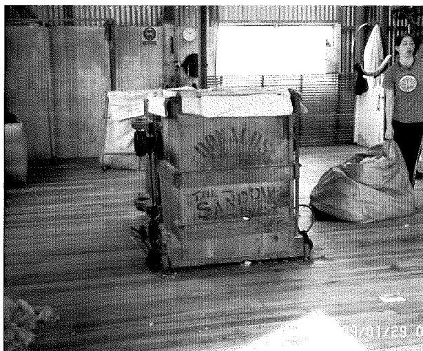
Figure 2, wool press.